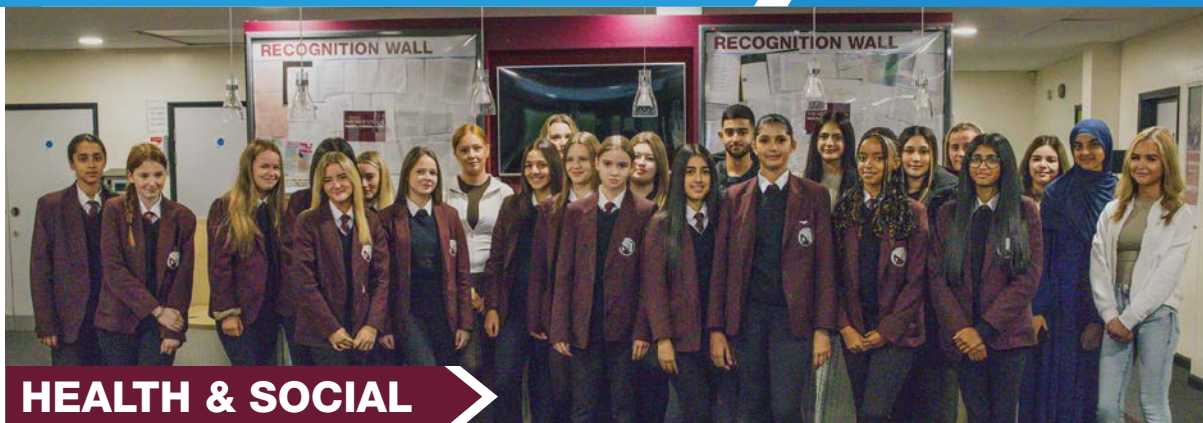
HEALTH & SOCIAL

Our Recognition and Rewards programme continues to grow, with even more incentives for students to aim for. From everyday learning celebrations with departmental postcards, to our 'Wall of Fame' the Recognition Wall and our end-of-term R&R trips, we're committed to celebrating hard work and dedication. As the programme becomes embedded into daily academy life, we're seeing students work harder and focus on putting as much effort as they can into different lessons, subjects and experiences.