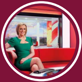
Steph McGovern Television Presenter